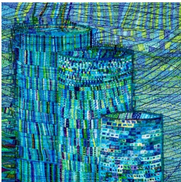
Untitled (Ink drawing on mixed media 30.5 x 30.5cm)