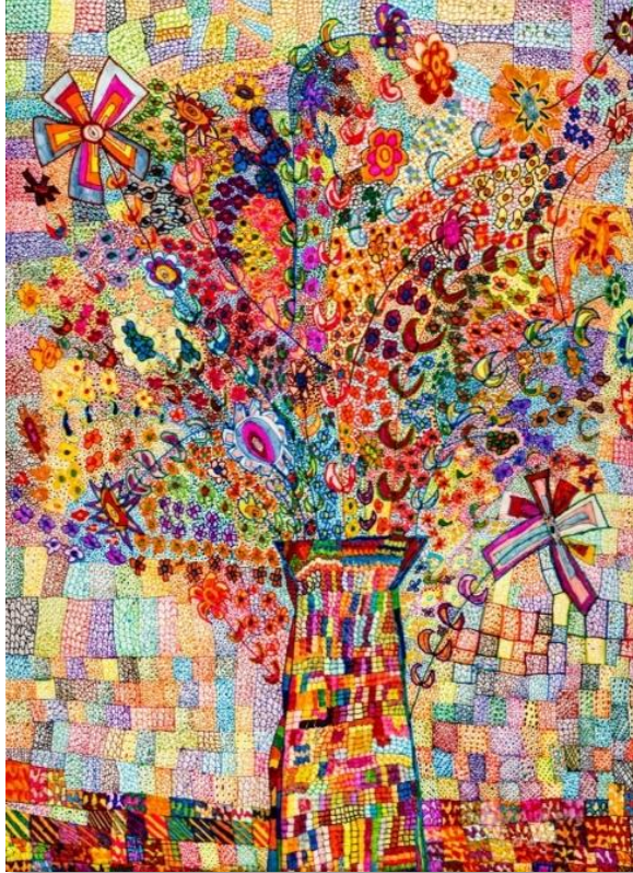
Flowerworks (Ink drawing on mixed media 36 x 27cm)