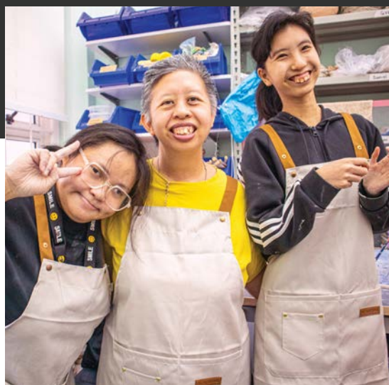
(Left) Tight friendships blossom within our Ceramic classes

The generosity of corporates, foundations, donors and sponsors enable us to continue running programmes that empower persons with disabilities in the arts.