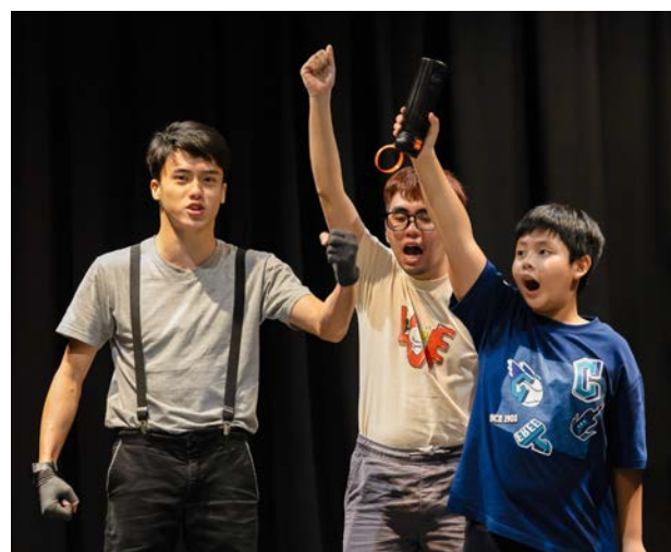
(Right) A training class for aspiring disabled actors, who are doing a class on vocalisation

ART:DIS is glad to be an enabler in his creative journey, and we look forward to how his arts education develops!